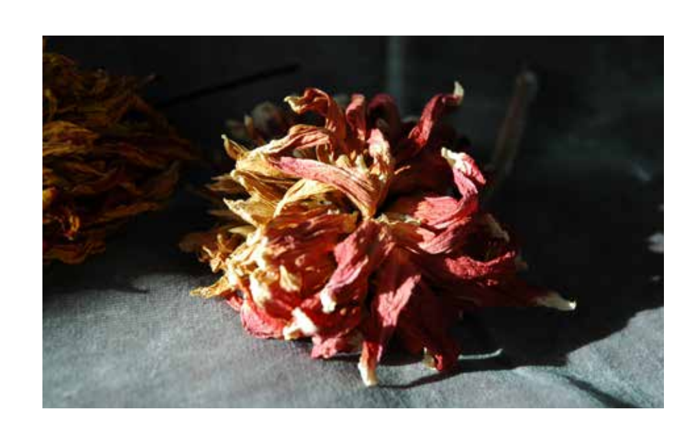
Nicolette Brunklaus took photos of dahlias fading over time and translated them into a beautiful carpet design